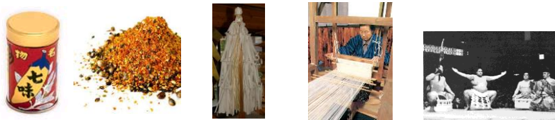
Japanese spice, Shinto shrine, Handmade fabric, Sumo wrestling

The Cannabis Control Law was enacted by the U.S. occupation period in 1948 after the World War II. The demand of hems was almost lost by the spread of synthetic fiber. Now, the hemp is used only as traditional materials of Japan.