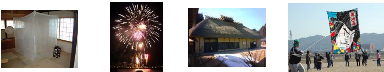
Mosquito net, Fireworks, Traditional house, Kite rope

A prefectural governor's license is required for cultivation of Hemp.